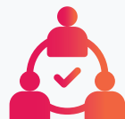
Dedicated R&D Team